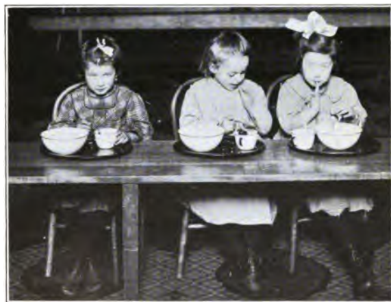
Lunches for children,—the street kind versus the school kind